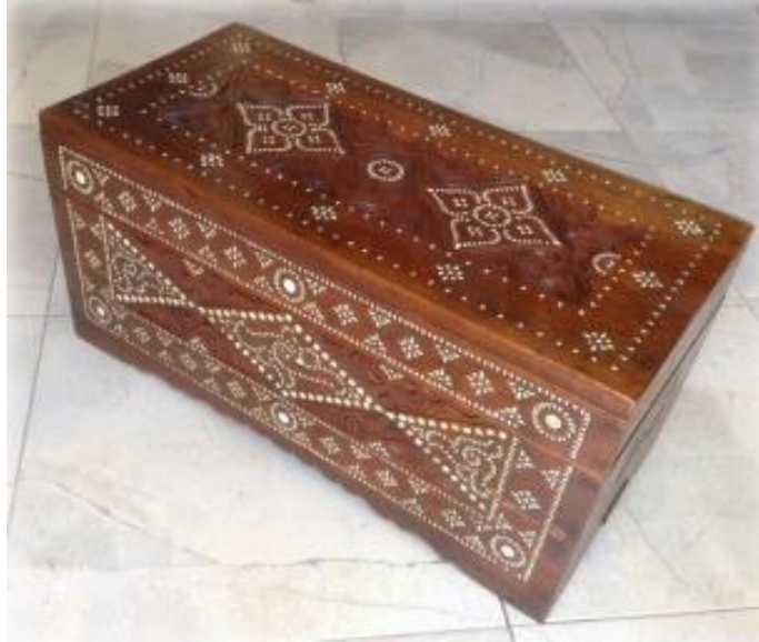
Without stand design OR

Dimensions: at least 24 inches (length) x 12 inches (height) x 12 inches (width)