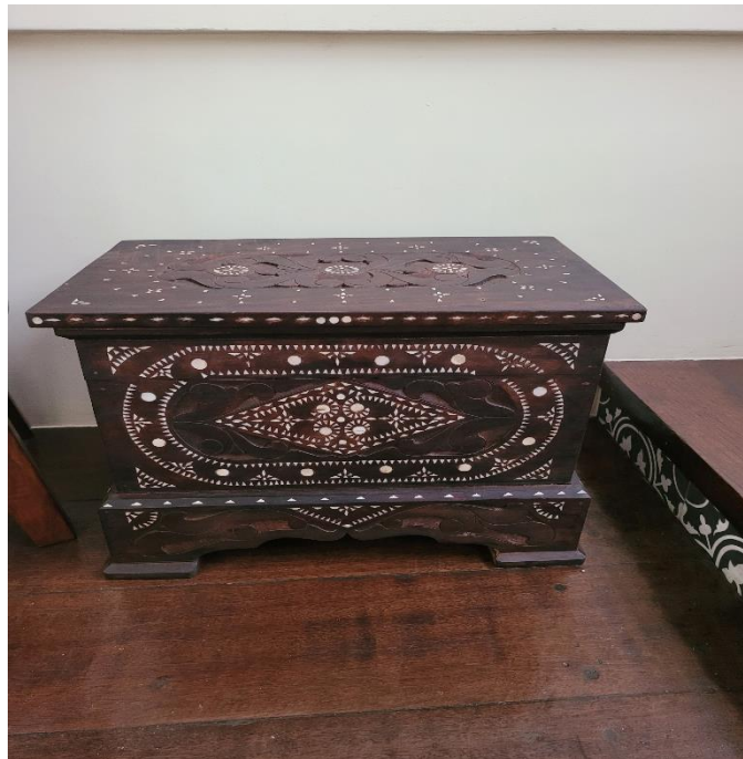
With stand design