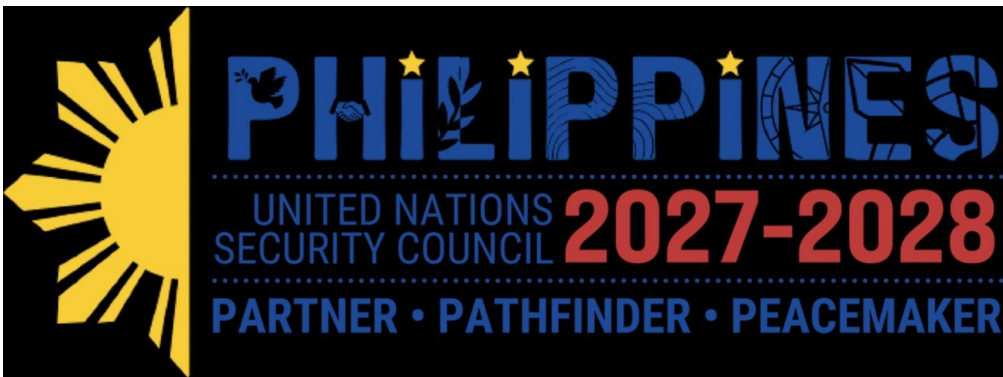
Annex 2: Prospective logo for the pouch (to be confirmed)