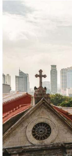
San Agustin Church